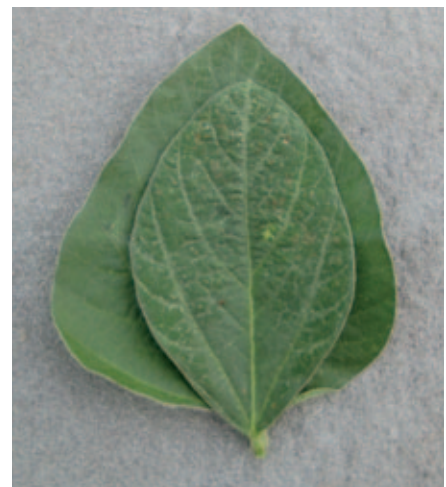
Leaf size comparison—forage soybean leaves are much larger, oftentimes 2-3 times larger. Apply this size difference across an entire plot and you realize the benefits of Eagle forage soybeans.

Less than six months later I was on a magnificent property and test plot on the Eastern shores of Maryland. Being a skeptical wildlife biologist who just couldn't put his hands on any "real data", I had to get to the bottom of it. My mind raced and I quickly imagined these plants had to be drought tolerant