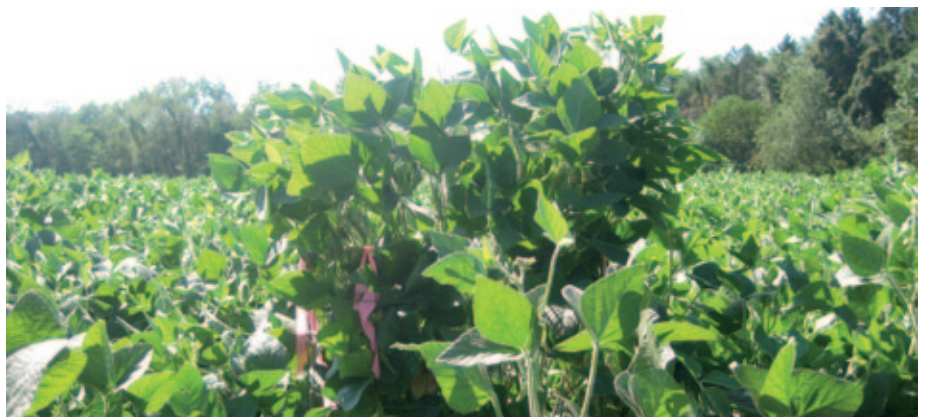
September 12, 2012 photo of a utilization cage on Drop-Tine Farms PA. Just two weeks prior to when this photo was taken the soybean plot was high enough to make finding the utilization cage nearly impossible. A utilization cage is an excellent gauge, suggesting where you fall on the population size/food plot acreage scale. During years with poor growing seasons, the utilization cage details the level, as well as the timing, of nutritional bottlenecks. The heavy utilization of this 3 acre plot makes the author nervous about extending the life of this particular plot.

For those of you who have battled Boone & Crocket weeds while waiting for warm season annuals to germinate and develop canopy closure it gets better! Eagle Seeds offers Roundup Ready® technology to manage your weed problems. Planting early can be a gamble that has the potential of paying off big or backfiring. The 2009 season on our research fields displayed just that. As a result of a perfectly timed planting, our deer enjoyed increased plant height, tonnage and soybean yield. In fact, had we been standing in the middle of that 2009 plot just 4 feet apart we could hear each other talking but we could not see each other due to the amazing height of the soybean plants. Needless to say, we also had deer utilizing that plot as bedding and security cover. We firmly believe the results of our hunting season (and upcoming shed