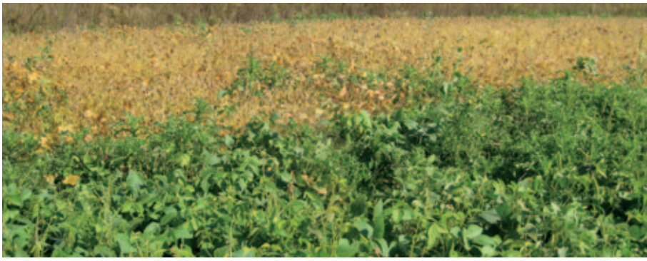
The Only Shop in Town! October 11, 2009 Drop-Tine Farms photo of actively growing Eagle forage beans planted next to a plot of agricultural beans. The forage beans remained green and continued to serve as an attractive forage throughout the Pennsylvania archery season.