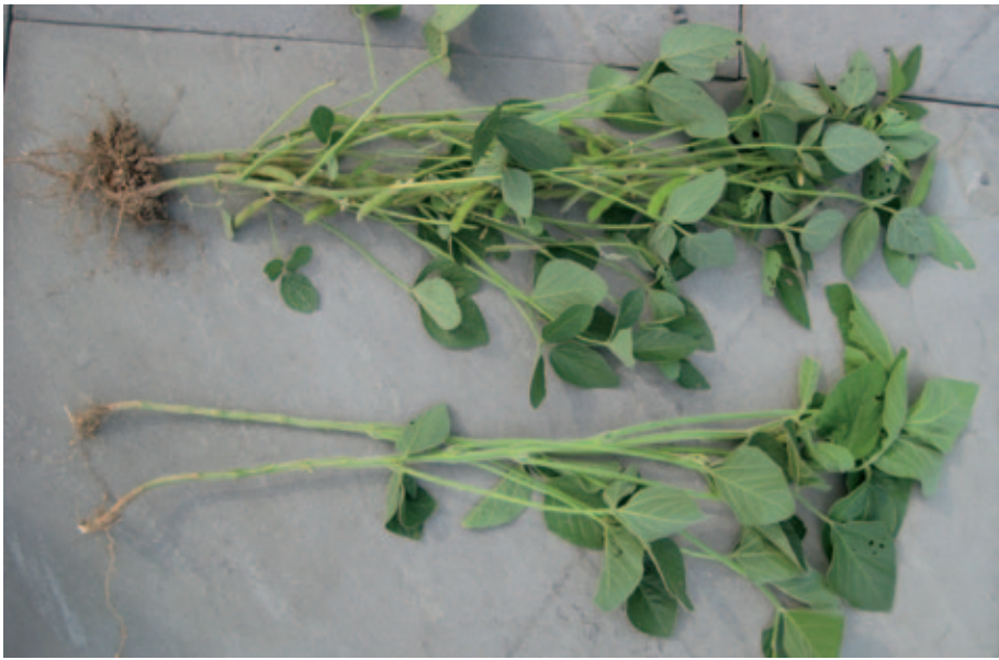
Forage soybean on bottom and Ag soybean on top pulled from Drop-Tine Farms on July 23rd 2012. Note that the Ag beans have already formed pods with maturing grain (past peak) whereas the forage bean is still performing as a high quality forage. Pods of grain will come later in the growing season.

ed, with assistance from Eagle Seed Co., different varieties of forage beans that produce pods of grain at different times throughout the growing season. Some begin early while others may never fully mature as optimal growing conditions wind down. This is ok and expected.