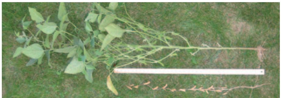
The explosive growth of forage soybeans is obvious in this picture. Equally important is the pod count on the forage beans; debunking the myth that forage soybeans do not produce pods of grain.

Forage varieties are bred to delay the flowering and reproductive stages. Why is this important? Those of you who already plant clovers, alfalfa, chicory and other food plot crops have experienced an increase in attraction immediately after a mowing. You know that attraction to deer declines as those plants mature. The reason for the sudden surge of deer activity after a mow-